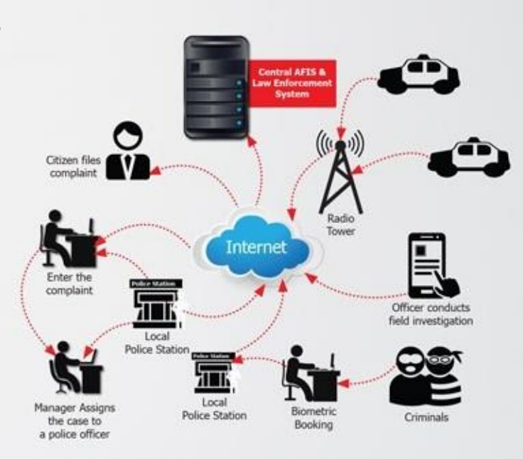
Fig: System Layout of M2SYS ABIS/AFIS