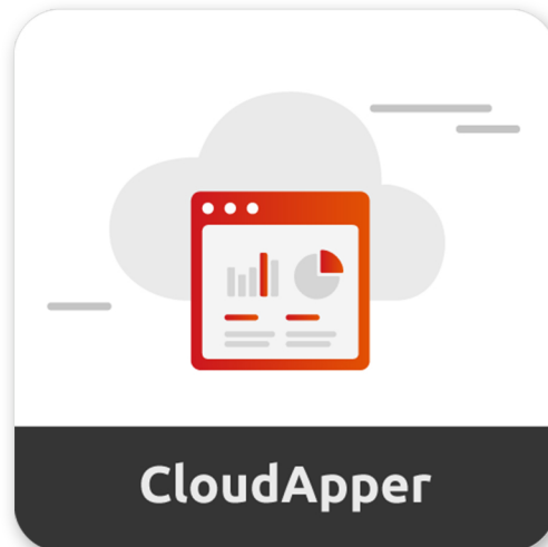
M2SYS CloudApper™ Cloud application development platform

M2SYS works closely with its clients, enabling them to capitalize on the benefits of using biometrics for security and accelerating their return on investment (ROI). These case studies of multi-modal as well as cloud-based biometrics security deployments for various verticals show how biometric security software solutions can protect the welfare of citizens, stop corruption and fraud, and create efficiency.